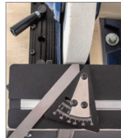
SHARPEN TOOLS AT EXACT ANGLES

holds woodturning gouges for sharpening bevels at consistent, repeatable angles and shape with your bench grinder and the PRO Sharpening System. Adjusts 40°, so setting bevels to grind on your tools is easy. Jig's clamp firmly holds tool shafts 3/16" to 1-3/8" thick and up to 1-9/16" wide. Ideal for sharpening spindle and bowl gouges, roughing gouges, and for maintaining their cutting edges – from simple bevels, to side ground variations, to the traditional fingernail shape. Works for sharpening carving tools, too!