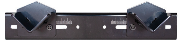
TOOL HOLDERS ADJUST FOR SETTING PROPER SKEW ANGLES